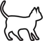
(a) A large cat