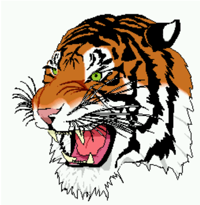
Figure 1. Tiger block image