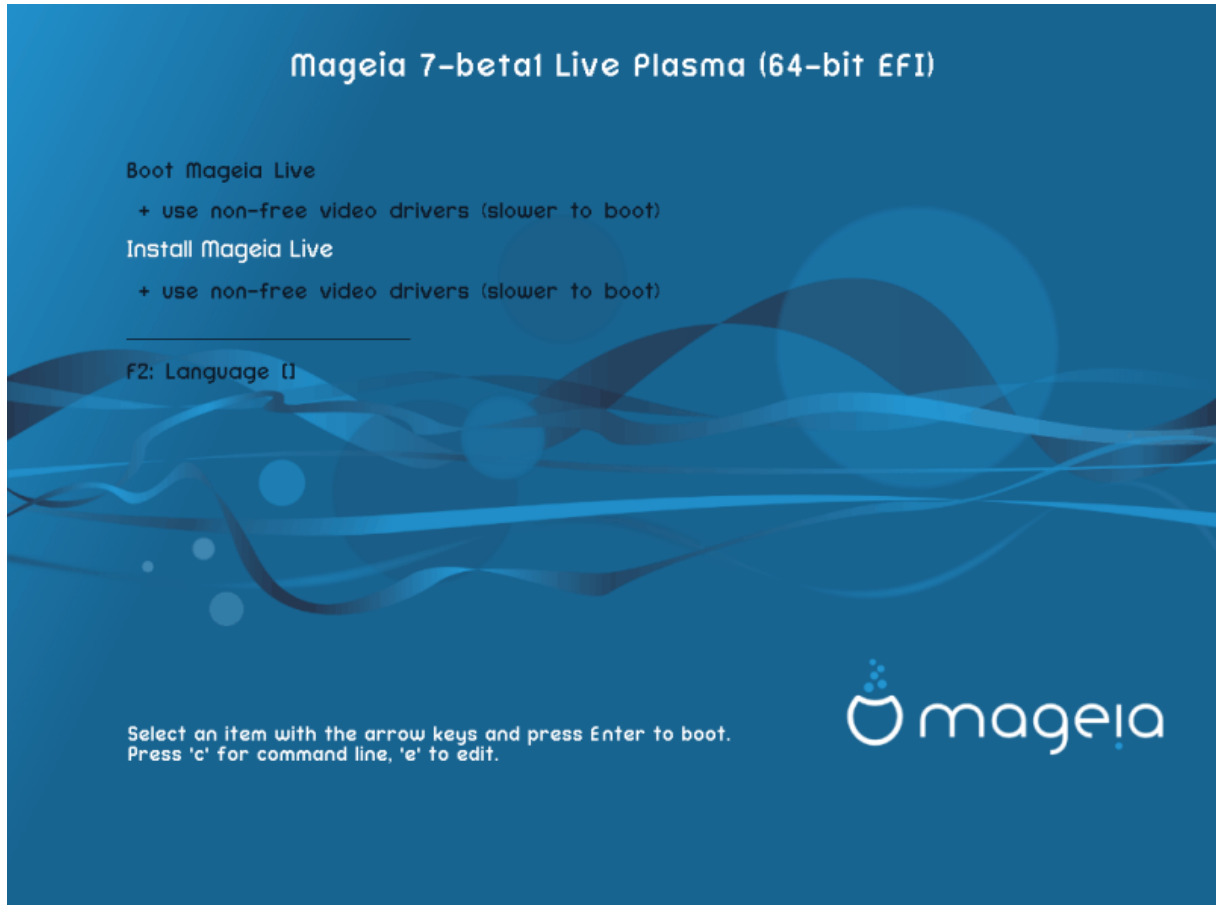
First screen while booting in UEFI mode